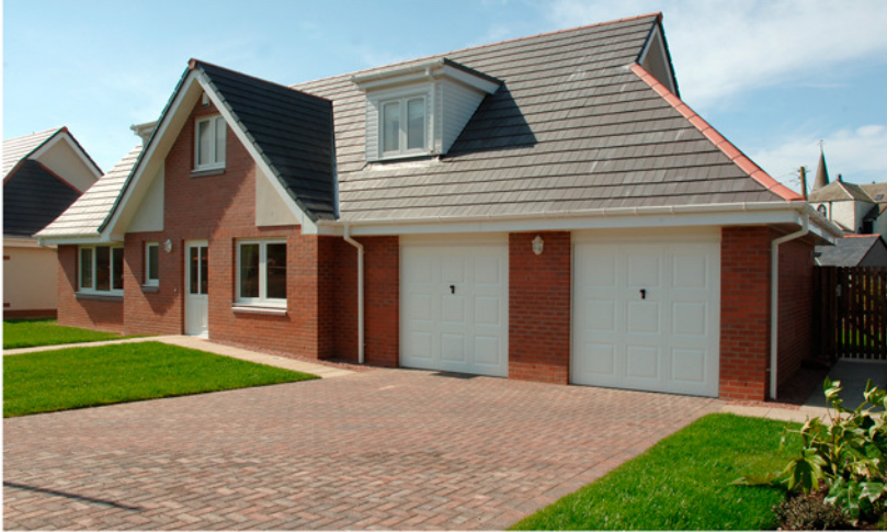
Computer generated imagery is subject to change, external finishes and landscaping may vary. Please contact sales representatives for further detail

This stunning 3 bedroom villa with double garage, is without doubt a beautifully appointed family home, with space for all to work or play