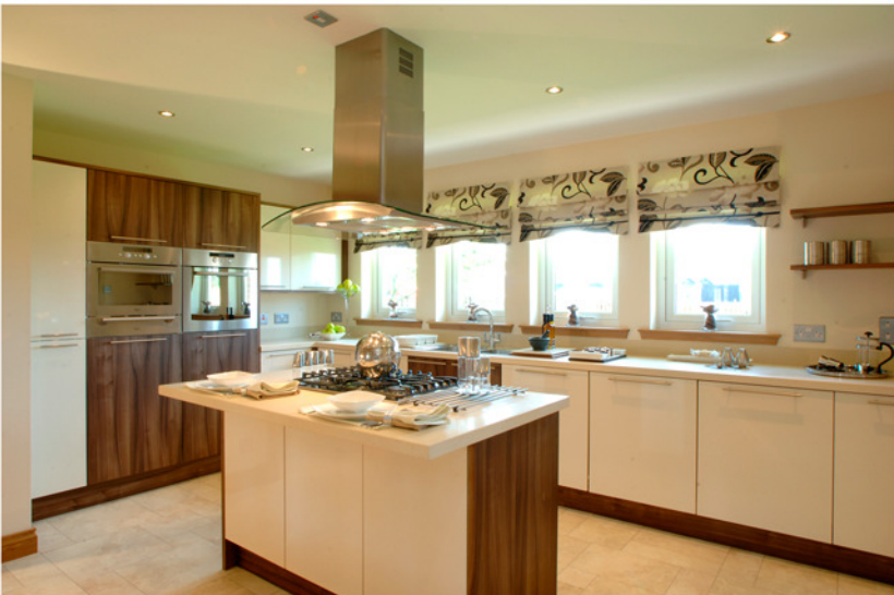
Computer generated imagery is subject to change, external finishes and landscaping may vary. Please contact sales representatives for further detail

Partuicular features include a separate utility room with a beautiful kitchen complete with island cooking centre