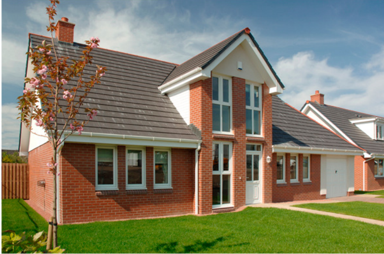
Computer generated imagery is subject to change, external finishes and landscaping may vary. Please contact sales representatives for further detail

This three bedroom home provides an impressive living space, featuring a fantastic family lounge with feature fireplace, double french doors lead out to the garden creating an airy garden room atmosphere.