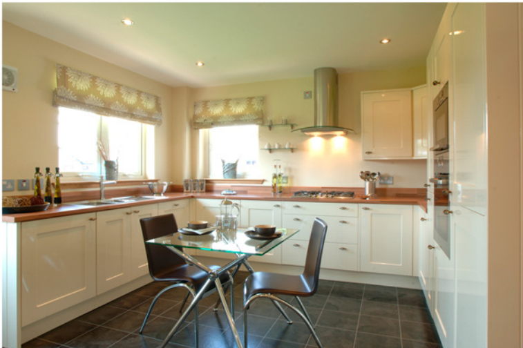
Computer generated imagery is subject to change, external finishes and landscaping may vary. Please contact sales representatives for further detail

This three bedroom home provides an impressive living space, featuring a fantastic family lounge with feature fireplace, double french doors lead out to the garden creating an airy garden room atmosphere.